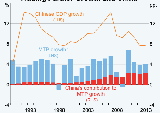
Graph A3 Trading Partner Growth and China

by 12¾ per cent in 2006, which corresponded to a CNY1 054 billion increase (in constant 1998 prices) in its GDP, while growth of 7¾ per cent in 2013 corresponded to an even larger increase of CNY1 265 billion. Similarly, the increasing importance of China as a destination for Australia's exports means that China's growth of 7¾ per cent in 2013 made around the same percentage point contribution to Australia's MTP growth as growth of 10½ per cent in 2010, and a larger contribution than growth of 14 per cent in 2007 (Graph A3). ↘