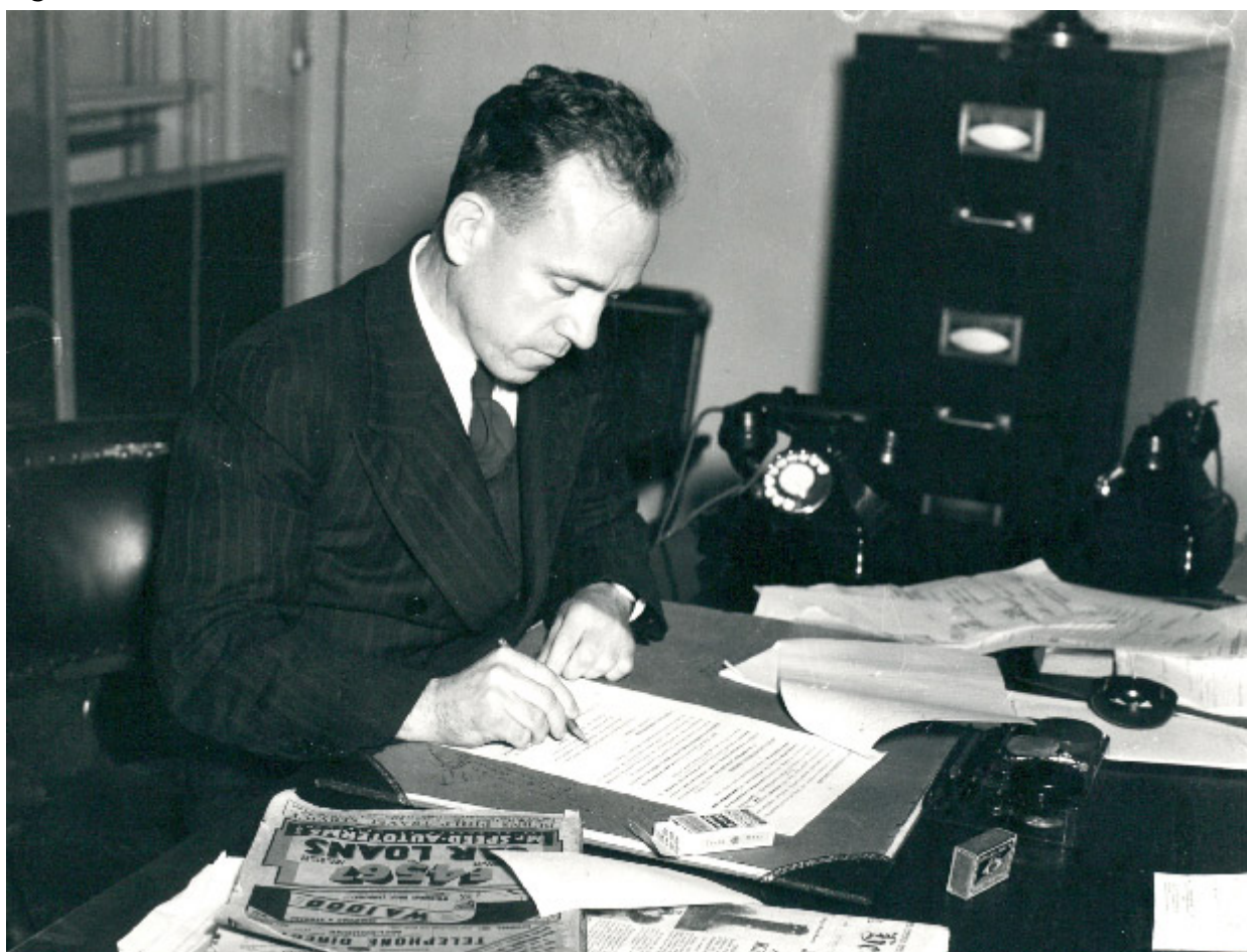
Dr HC Coombs in his role as Commonwealth Director of Rationing, May 1942