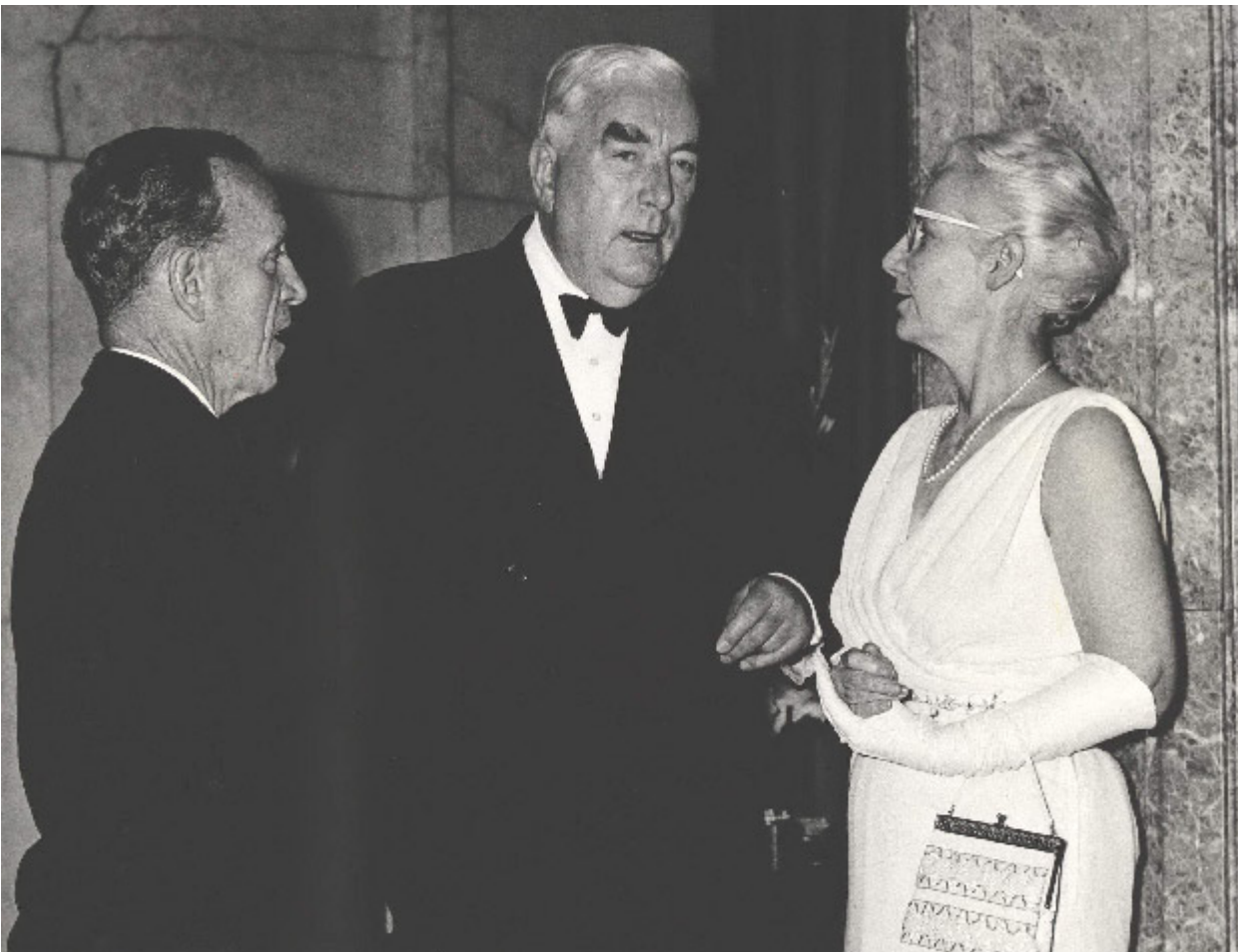
Robert Menzies, Prime Minister of Australia, with Dr and Mrs Coombs at a Reserve Bank of Australia Board dinner, 1962