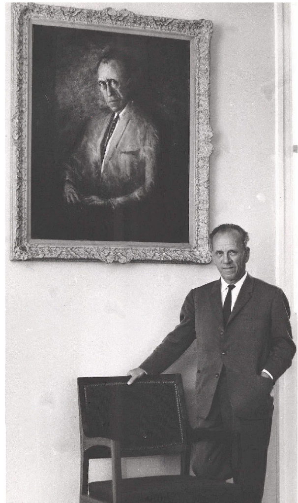
Dr HC Coombs at the opening of the HC Coombs Building at the Australian National University, 11 September 1964, posing beside a portrait of himself by Australian artist Clifton Pugh