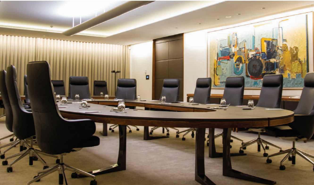
The Reserve Bank's boardroom in the Sydney Head Office building

The Payments System Board also has responsibility to ensure that the powers and functions of the Bank under Part 7.3 of the Corporations Act 2001 (dealing with licensing of clearing and settlement facilities) are exercised in a way that will best contribute to the overall stability of the financial system.