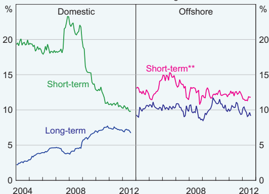
Graph A2 Wholesale Funding of Banks in Australia* Share of total funding

* Adjusted for movements in foreign exchange rates; wholesale debt is on a residual maturity basis