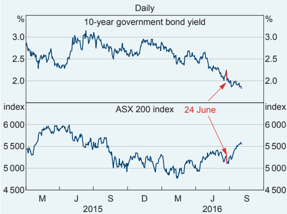
Graph C1 Australian Government Bonds and ASX 200

There were large movements in financial markets on 24 June as it became apparent that the UK referendum would result in a majority voting for the option to leave the European Union. In Australia, as in other countries, there were large movements in exchange rates, government bond yields and equity prices over the trading session as results from the ballot count were announced (Graph C1). Amid the increase in market volatility, there was a substantial pick-up in market turnover and the key markets where price discovery takes place functioned well and remained highly liquid.