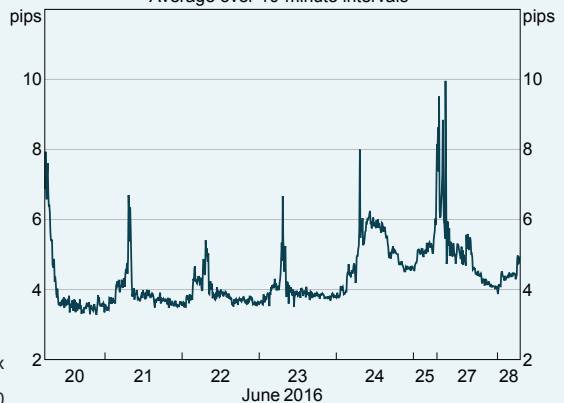
Graph C2 AUD/USD Bid-ask Spreads Average over 10-minute intervals*

* Australian Eastern Standard Time (AEST)