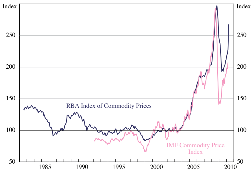
Figure 1: Nominal Commodity Prices SDRs, 2001 = 100

This general experience stands in contrast to the decline in commodity prices relative to the prices of other goods and services over much of the 20 th century (Figure 2). Notably, the strength in commodity prices over the past decade has