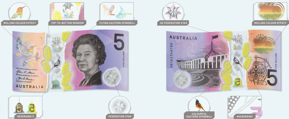
Figure A1: Security Features of the New $5 Banknote

Table A1. There are also a number of features that are used by machines to authenticate banknotes, which are not listed below.