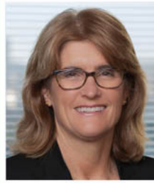
Deputy Governor Michele Bullock