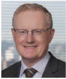
Governor Philip Lowe