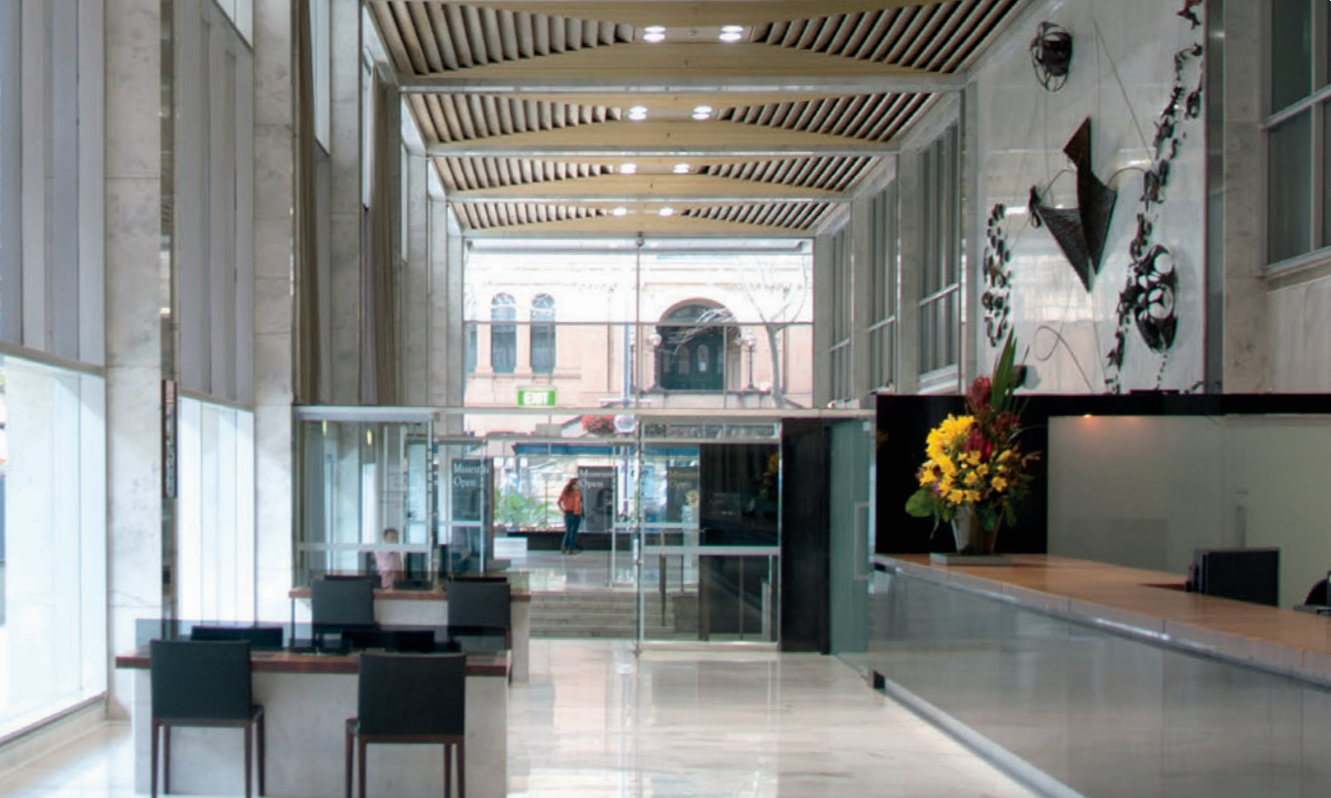
The foyer of the Head Office building in Sydney, viewed from the banking chamber, with Bim Hilder's 'wall enrichment' sculpture on the right

providers, which is expected to be completed towards the end of 2017. The NPP will allow authorised deposit-taking institutions to send real-time, data-rich payments on a 24/7 basis for households, businesses and government agencies. It will also provide more user-friendly ways to address payments, for example through the use of mobile phone numbers and email addresses. The Reserve Bank is actively participating in the broader NPP program and is also building the RITS Fast Settlement Service (FSS), which will settle NPP payments individually in real time. The FSS has been designed for high performance and high availability. Payments settled through the FSS will be final and irrevocable, enabling financial institutions to provide for immediate funds availability to customers without incurring credit risk.