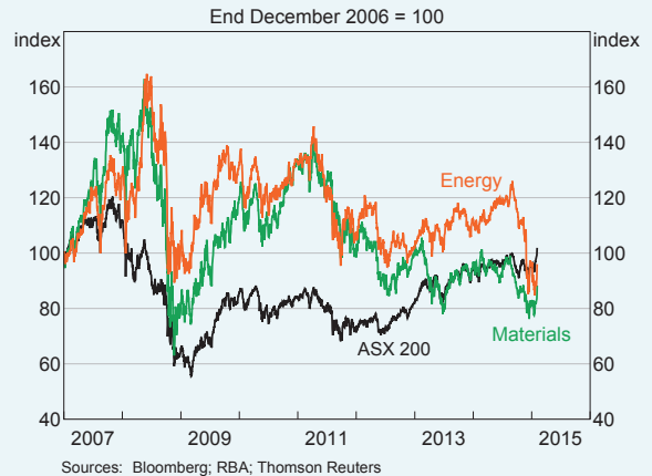
Graph D1 Resource Sector Share Prices

The decline in the oil price, which began around the middle of 2014, accelerated into the end of the year following the November OPEC meeting. Long-term liquefied natural gas (LNG) contracts in Australia are typically linked to oil prices and, with a number of large LNG projects due to commence production over the next couple of years, the falls in expectations for future oil prices have led to falls in energy sector share prices.