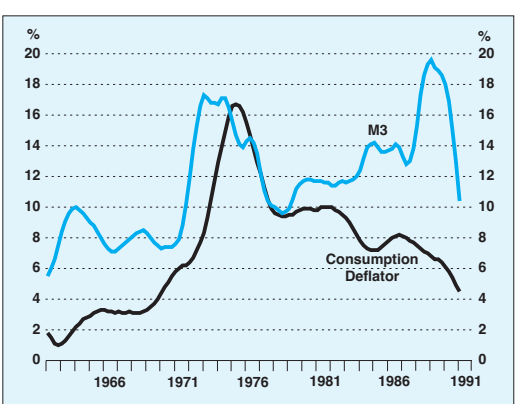
MONEY AND PRICES Annual rates of change; 11-quarter centred moving average

The breakdown is illustrated in Graph 2.