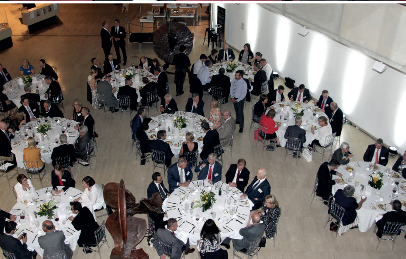
(Image top) Reserve Bank Board community dinner, Hobart, April 2016; (image above) Reserve Bank Board community dinner, Perth, December 2015