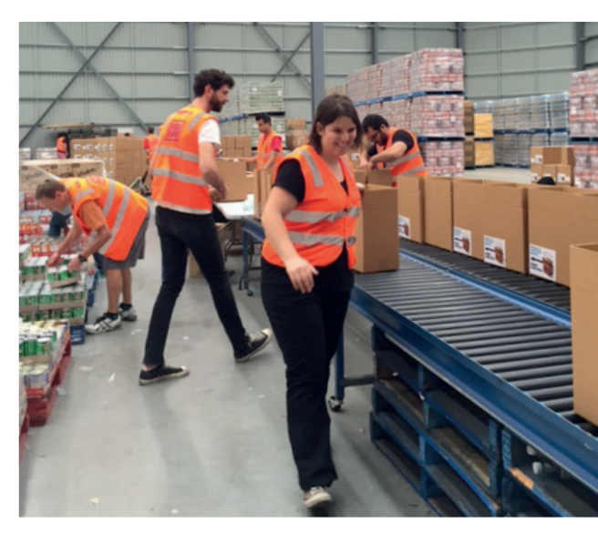
Reserve Bank staff volunteering at FoodBank, December 2015

During 2015/16, the Reserve Bank made its 14th annual contribution of $50 000 to the Financial Markets Foundation for Children, which is chaired by the Governor. For many years, the Bank has donated a signed uncut banknote sheet to the ASX Thomson Reuters Charity Foundation for auction, which usually raises over $30 000. The Foundation includes the Financial Markets Foundation for Children in the distribution of auction proceeds. In early