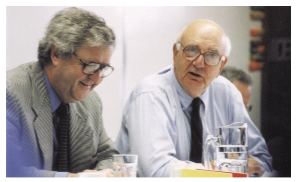
At the RBA's 1999 Conference on "Capital Flows and the International Financial System", the Governor with former Chairman of the US Federal Reserve Board, Paul A Volcker.

investors from offshore (sometimes in Australia and sometimes overseas), and some Australian market participants and commentators expressed the view that they were being disadvantaged by not having access to remarks which were being made in these gatherings. All the Governor's speeches are now before public audiences and open to the press.