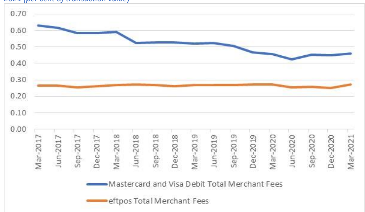
Figure 3: Quarterly Average Debit Card Total Merchant Fees – March Quarter 2017 to March Quarter 2021 (per cent of transaction value)